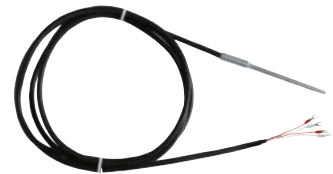
Lead wire type